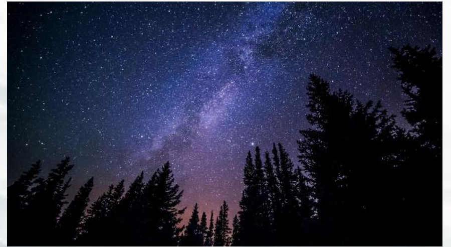
night sky at Pieniny National park

Pieniny National park – a great place to observe night sky