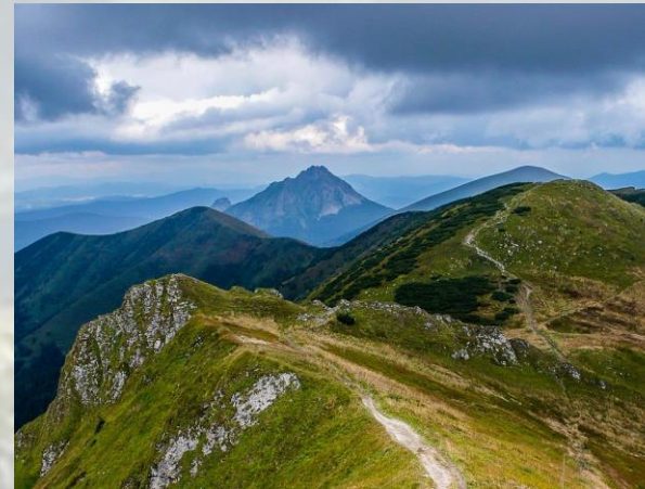
Malá Fatra National park