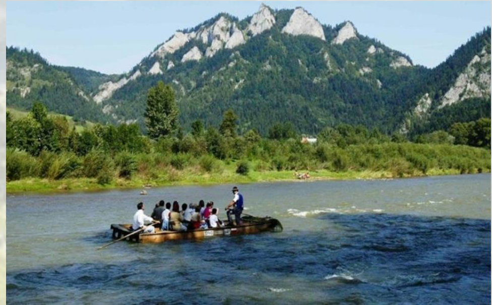
sail on rafts on Dunajec