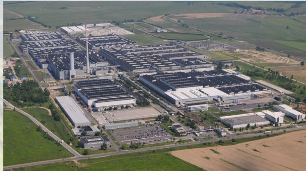
Volkswagen in Bratislava