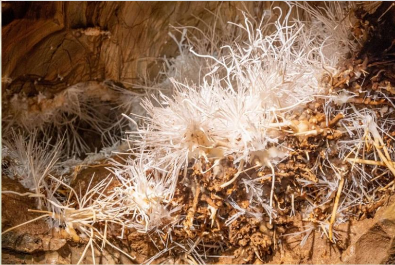
unique aragonite formations in Ochtinská Aragonite Cave

Slavakia has over 7000 caves, but only a few of them are open to the public. Most visited are Dobšiná Ice Cave, Ochtinská Aragonite Cave, with unique aragonite formations and Domica, which continues into Hungary. These caves are included in Unesco world heritage list.