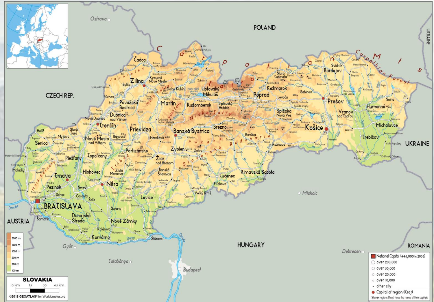
map of Slovakia

Slovakia is an inland country located in central Europe. Slovakia is bordered by Poland to the north, Ukraine to the east, Hungary to the south, Austria to the southwest and the Czech republic to the west.