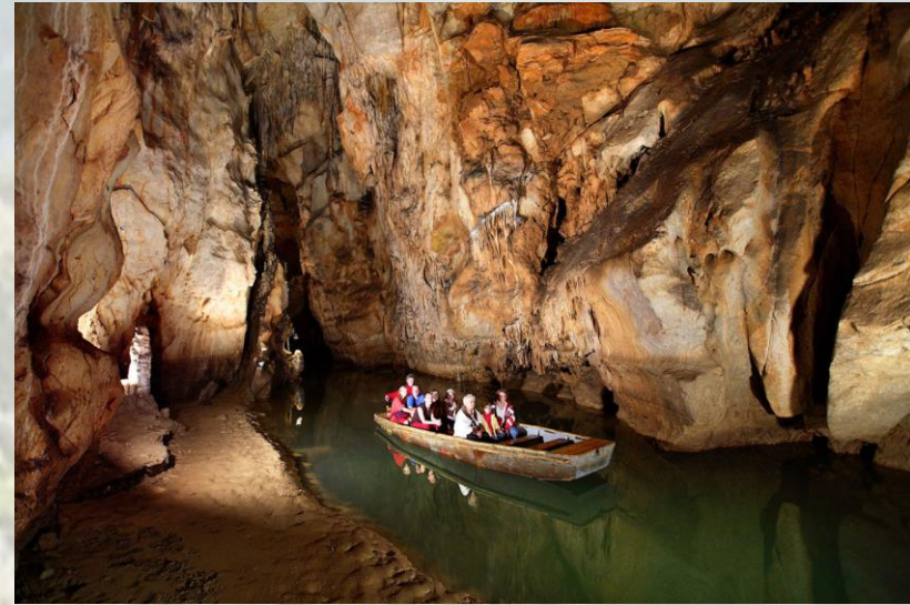
sail on a boat in Domica