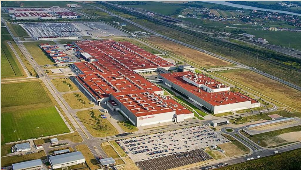
Kia Motors Žilina Plant

The main industry sectors in Slovakia are car manufacturing and electrical engineering. In fact, Slovakia has been the world's largest producer of cars per capita. There are currently four automobile assembly plants: Volkswagen in Bratislava , PSA Peugeot Citroën in Trnava, Kia Motors Žilina Plant and Jaguar