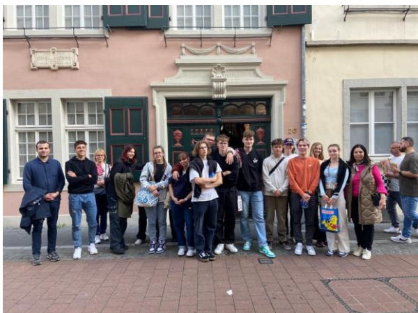
Beethoven House - Bonn