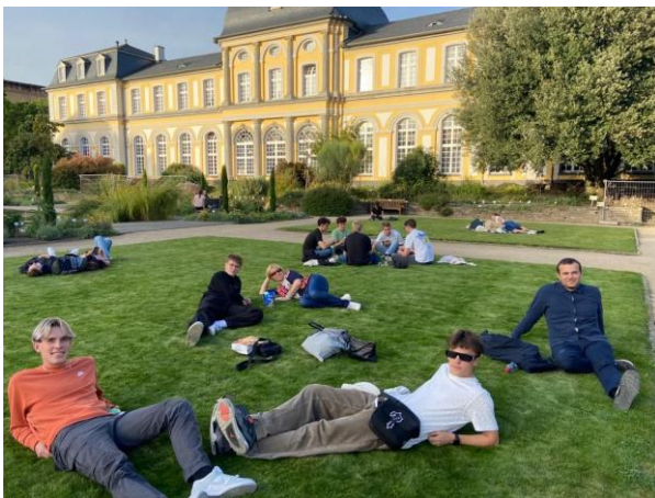
Botanical Garden Bonn