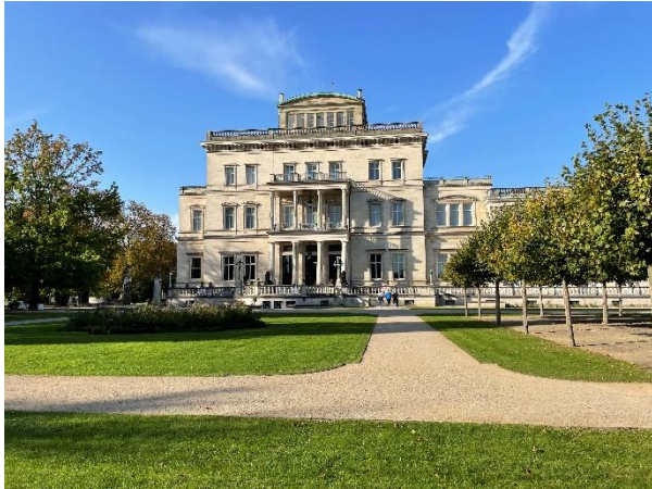
Villa Hügel - Essen