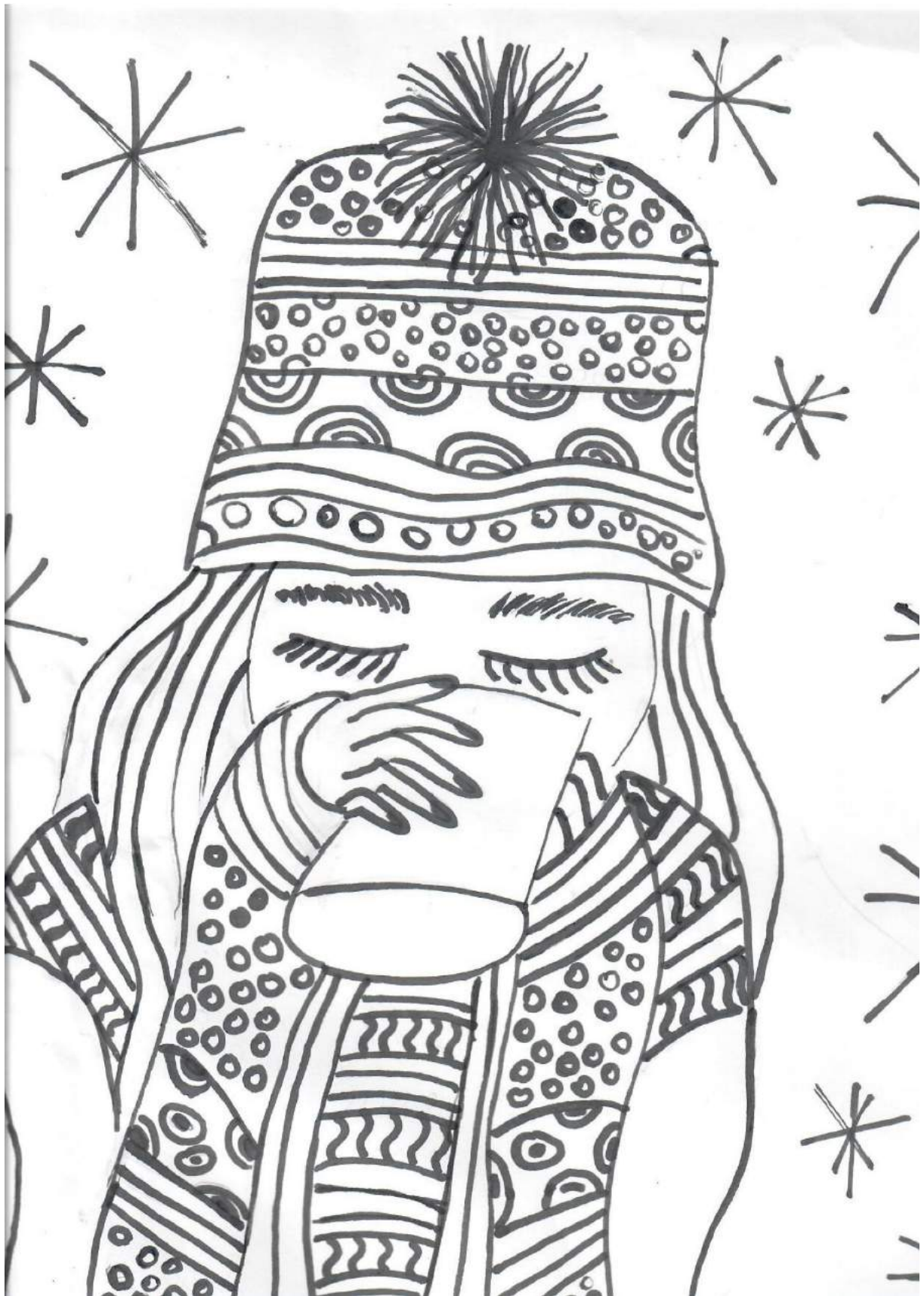
Illustration by Viktória Kováčová, 6.b