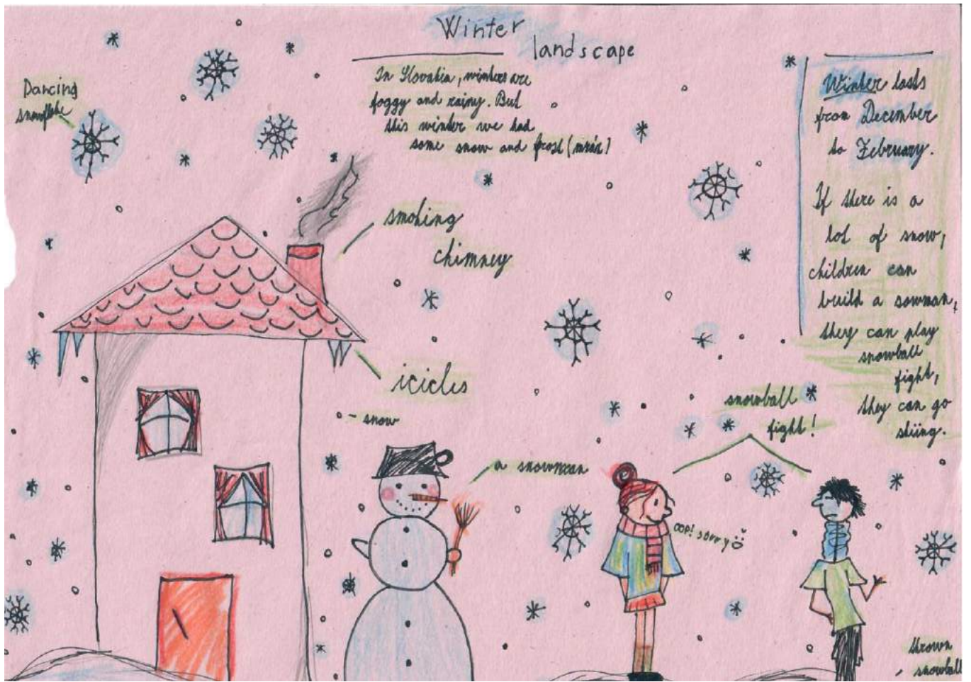
Illustration by Tamara Šustáková, 6.a class